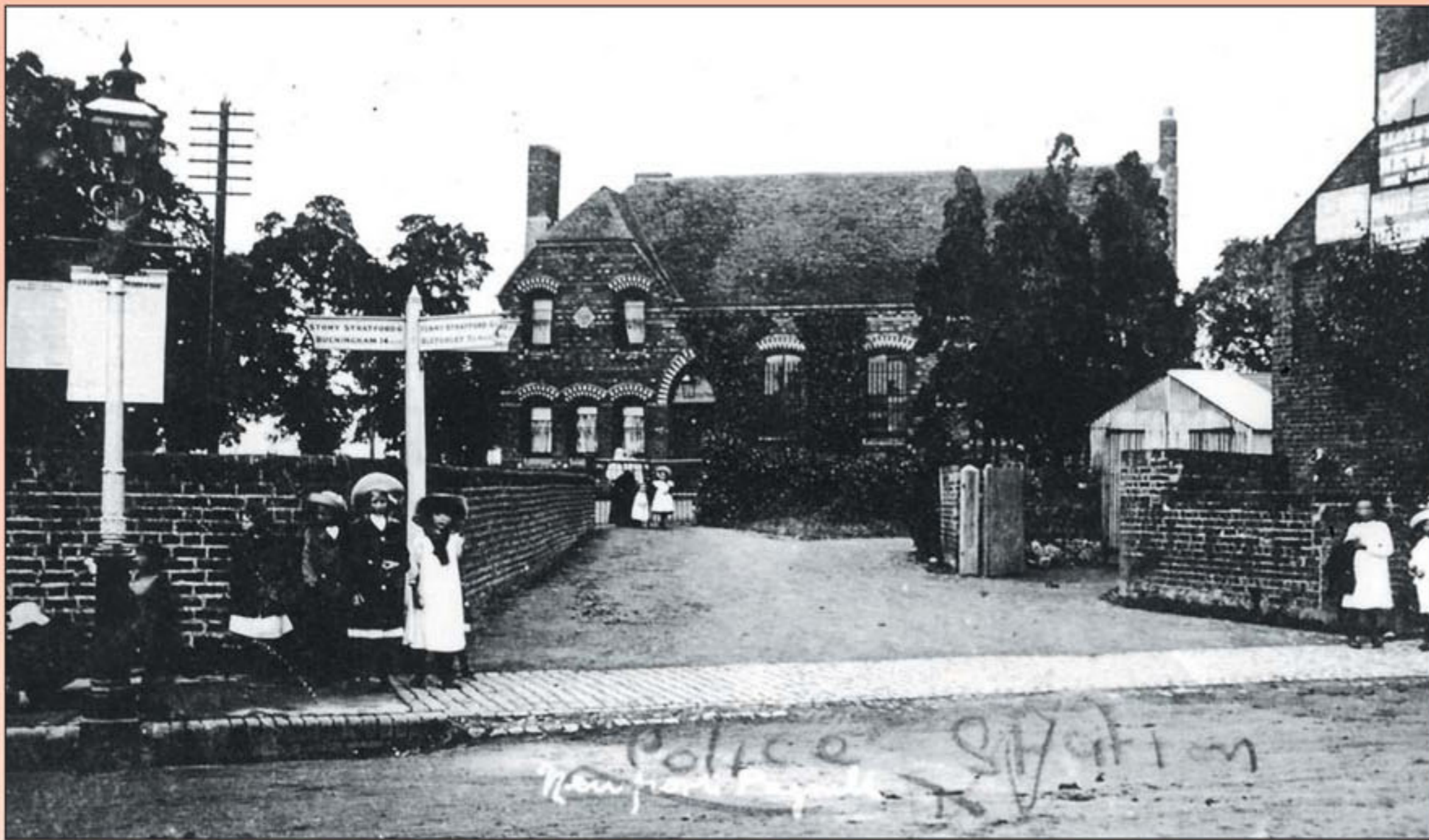
Newport Pagnell Police Station c1910

Newport Pagnell Police Station was built in 1872 and it cost £1,400. There were four Policemen in Newport Pagnell and one Inspector who lived in the Police house. The Inspector grew vegetables for his family in the garden. The garden has been converted into a car park.