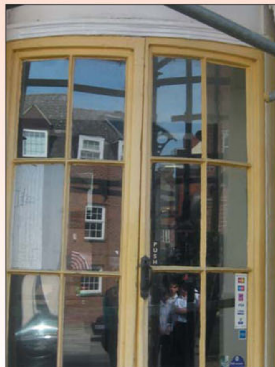
The curved doors, June 2010