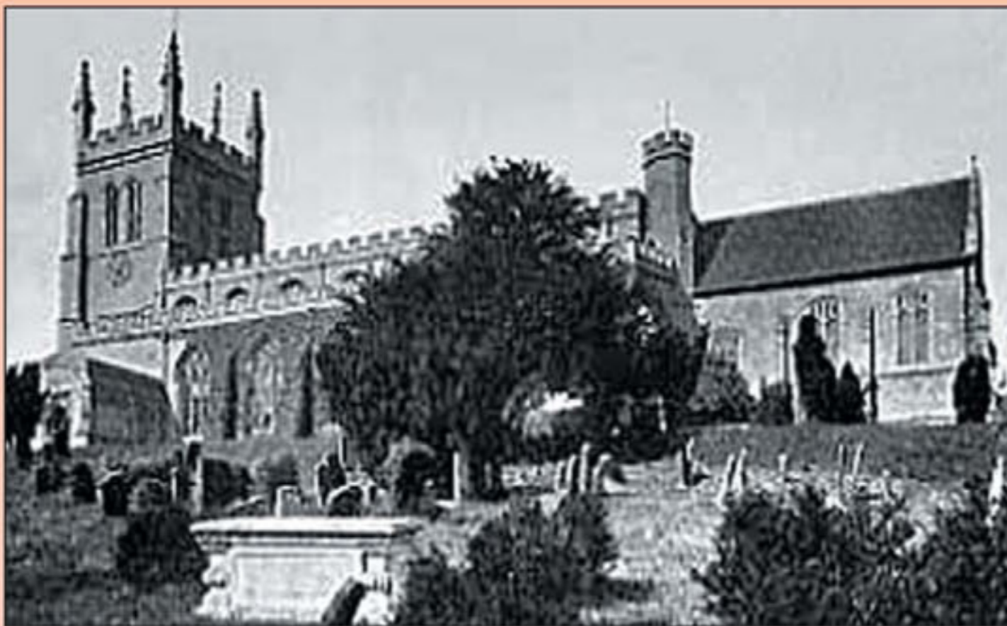
St. Peter and St. Paul's church

St. Peter and St. Paul's church is situated in the High Street of Newport Pagnell. The church was built in 1350, but it didn't have a tower. The tower was added in the 16th century.