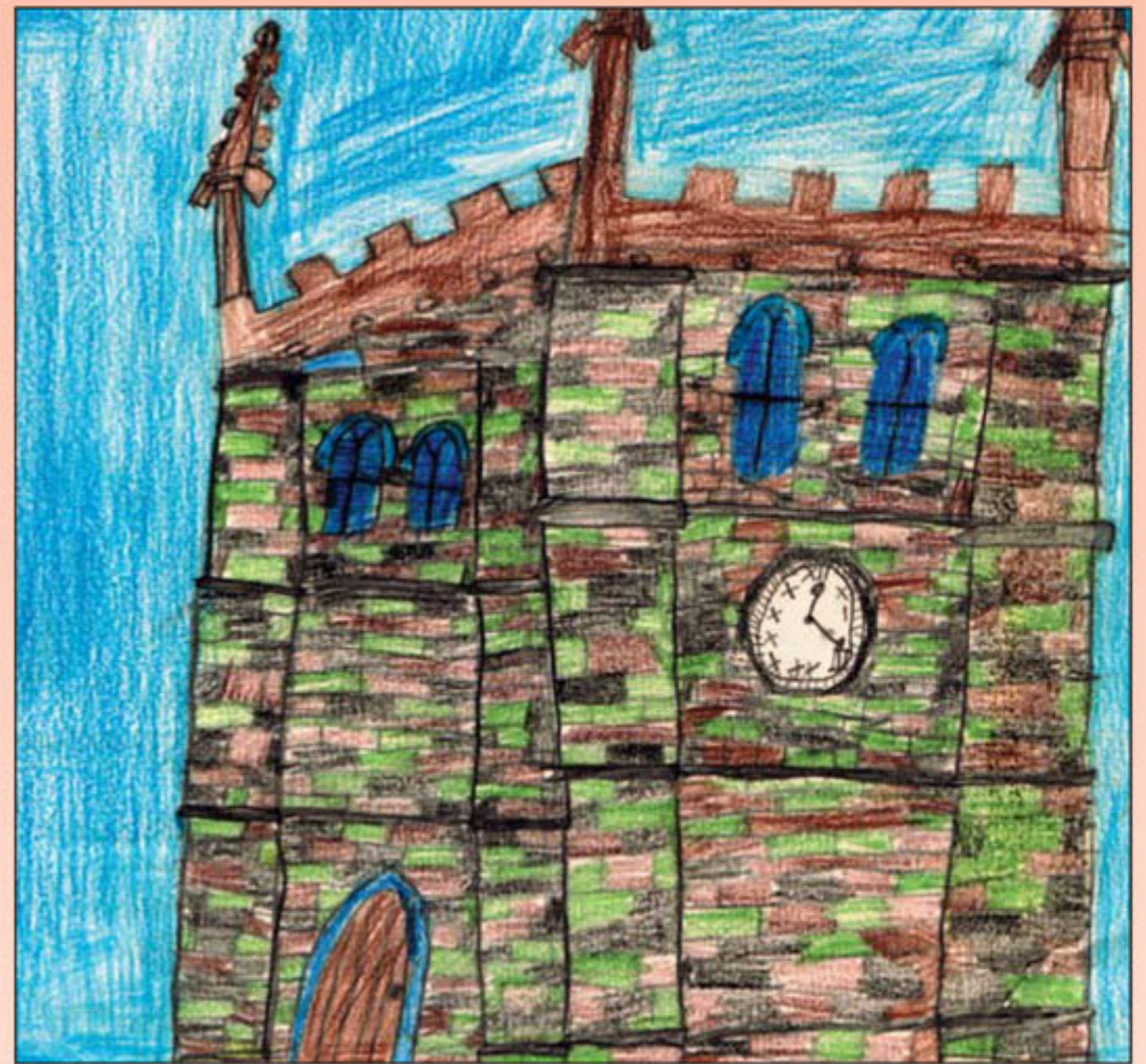
Drawing by Ava, aged 9

The church graveyard was full so the gravestones were used as a path. A bridge was built which leads to a new graveyard. People think it is haunted by the ghost of a man who fell down the well.