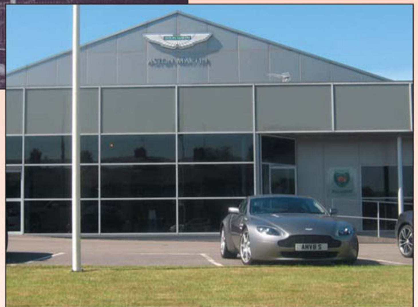
Aston Martin June 2010

The final Aston Martin to be manufactured at the Newport Pagnell factory was the Vanquish Ultimate.